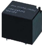
Dust Covered 26.8×21.5×22.3

20142 Milano - Italia - via Valsolda,15 tel (+39) 02.8959.0214 - fax (+39) 02.8959.0400 e-mail: fitre.componenti@fitre.it - web site: www.fitrecomponenti.it