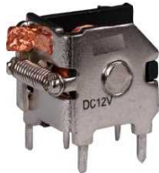
Open Type 24×19×20